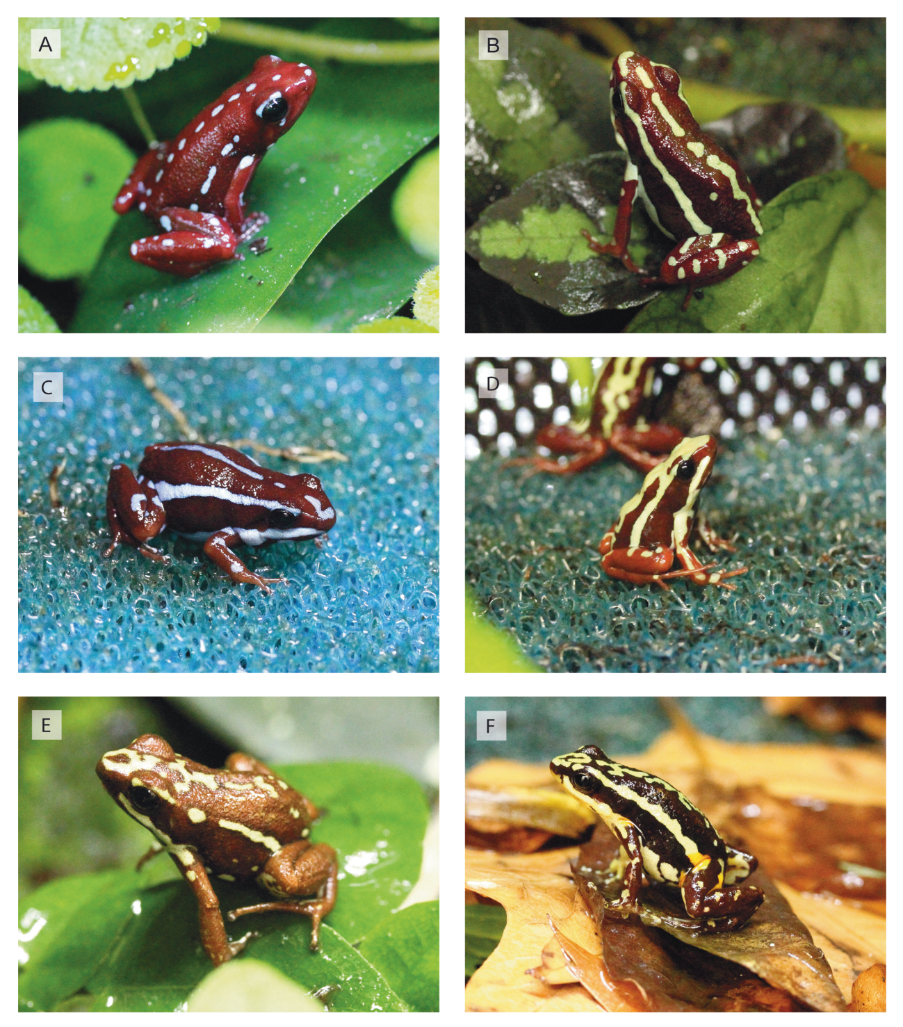
Fig. 1. Photographs of selected specimens of all study populations of Epipedobates anthonyi and Epipedobates tricolor . A: E. anthonyi I: "Buena Esperanza". B: E. anthonyi II: "Rio Jubones". C: E. anthonyi III: "Rio Saladillo". D: E. anthonyi IV: "Tierra alta". E: E. tricolor V: "Moraspungo". F: E. tricolor VI: "Rio Soloma".

been reported for this species and besides the known functions (courtship behavior, territorial behavior, competition, localization, defense signal, distress signal and alarm signal) (e.g., Bogert 1960; Whitney & Krebs 1975; Wells &